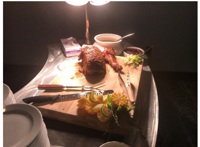
The November meeting and Auction was a successful and fun event and the food was yummy!!!!