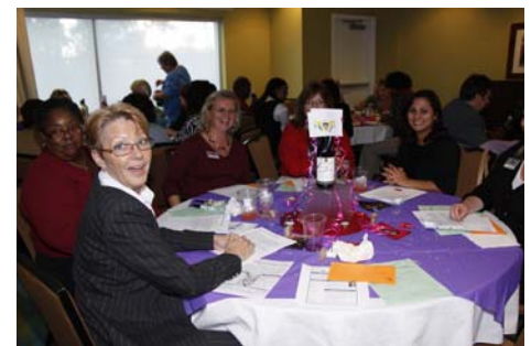
Above –Planners and Suppliers enjoying our show of appreciation to you the SUPPLIERS for all that you do during the year. Thank YOU!

"A Kind Word Always Works" to you from the mystery writer