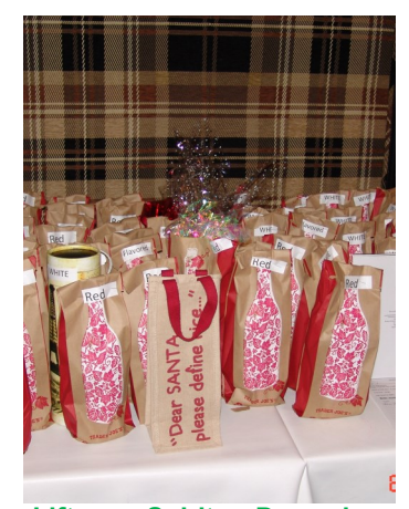
Lift your Spirits—December 8th! There were lots of spirits to be had! Over 50 people attended the event!