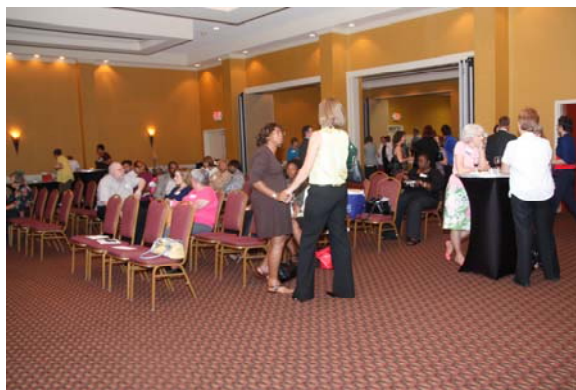
Awaiting the bidding wars to start...